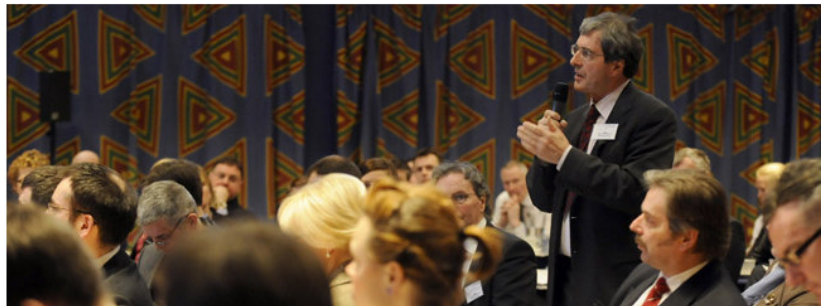
Edinburgh: The Next 5 Years [CLOSED]